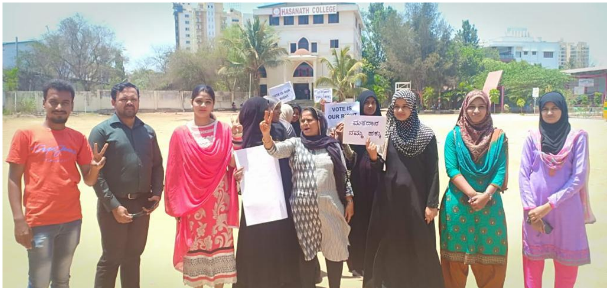
'Right to Vote' Awareness Programme