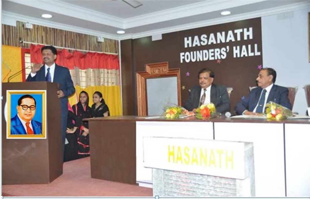
Celebration of Dr. B.R. Amedkar's Birth Annibersary